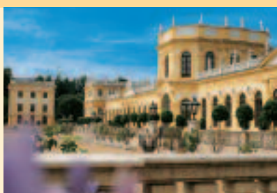
Orangerie in Kassel

Hesse, in the heart of Germany, is proud of its 40 spectacular vestiges from 2000 years of cultural and architectural history, ranging from the Limes wall to English landscape gardens. The multitude of fortresses, castles and parks whisk you away, back into feudal times authentically reflecting the aristocratic lifestyle. In Kassel Wilhelms-höhe Castle and Park, Karlsuae State Park and Löwenburg form a unique synthesis of the arts in terms of architecture and landscape gardening. The castle in Bad Homburg vor der Höhe was the first modern residence after the Thirty Years' War and a popular summer residence of the Hohenzollern. One of the earliest English landscape gardens in Germany, State Park Wilhelmspark, a real picture book health spa for 230 years, is to be admired in Hanau. Wiesbaden proudly shows off its many