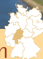
Frankfurt on the Main