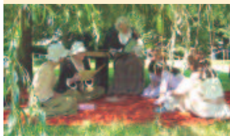
Goethe Festival in Wetzlar

beautiful parks making it one of the greenest state capitals. Bibrich Castle, an imposing baroque construction on the bank of the Rhine is a special highlight. The centre of Fulda is dominated by the baroque castle of the prince-abbots. But Castle Fasenerie, their sumptuous summer residence with its copious antiquity collection, is also worth a visit. Verna Park in Rüsselsheim with its ruin, mill and obelisk takes you on a time travel back into the late romantic period. Close by there is the fortress dating back into the year 1399. The botanic garden of Justus-Liebig University in Gießen is Germany's oldest botanic garden. Founded in 1609 it fascinates with its age-old tree population, its tropic and pot plants. How to transform botany into perfect garden art may be admired in Darmstadt's Prince Georg Garden. The rococo pleasure garden, one of many green jewels of the city, borders on the park of the residential castle. Frankfurt, too, disposes of an exotic paradise in the midst of imposing skyscrapers: the "Palmgarten" is jungle, desert, rain forest and city park all in one, since 1869.